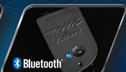
Traxxas Link ™ Wireless Module connects with your iPhone, iPad, or iPod touch*

Wirelessly adjust your transmitter settings and receive real-time telemetry from your model with Traxxas Link ™