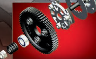
Torque-Control Slipper Clutch