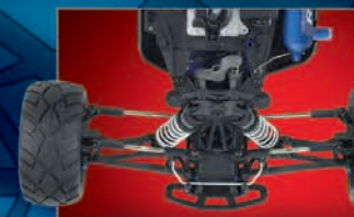
Front and Rear Sway Bars