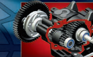
Precision Close-Ratio Two-Speed Transmission