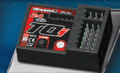
5-Channel Receiver With 3 Telemetry Ports