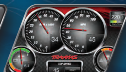
Telemetry Sensors Installed View speed, RPM, temperature, and voltage data on the Traxxas Link dashboard