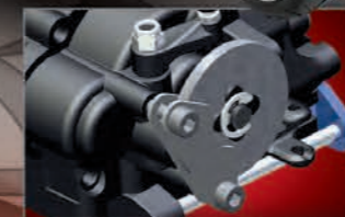
Large Diameter Disc Brake